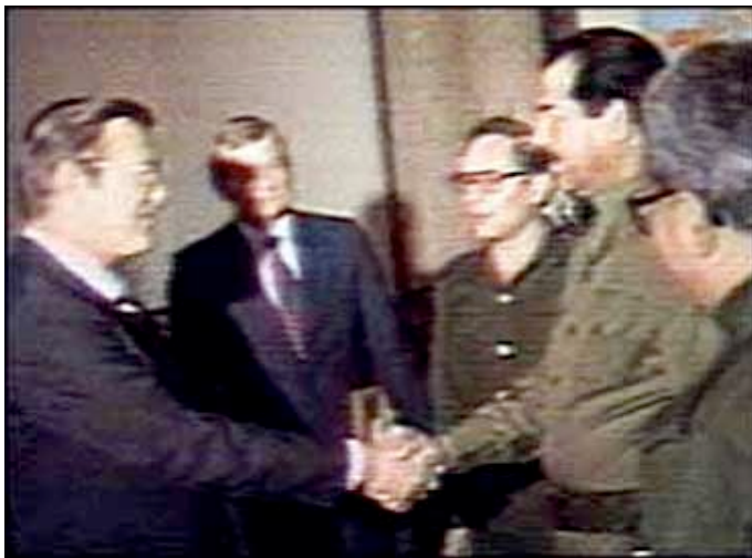
“Whose your Baghdaddy?”